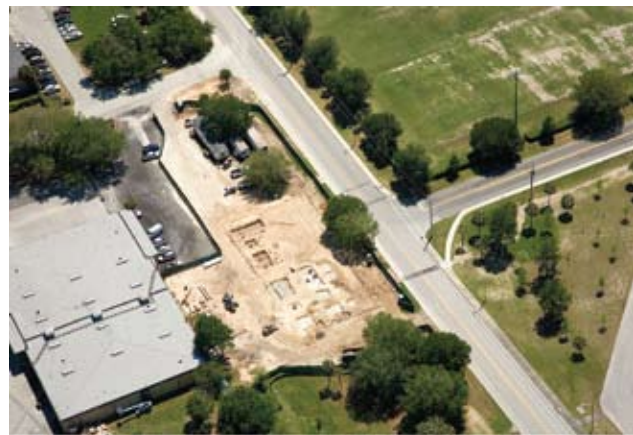
Student Health Care Center University of Florida

In April 2010, the Student Health Care Center women's health, mental health, and Gatorwell services will move to the new location on Radio Road. An additional pharmacy will be available at the new building, complete with a drive-thru window for students' convenience. Student Health services will now be available at 5 different locations, including the main Infirmary building, SHCC @ Shands, SHCC @ Corry Village and SHCC@ Jennings.