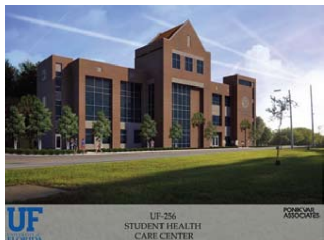
UF-256 STUDENT HEALTH CARE CENTER